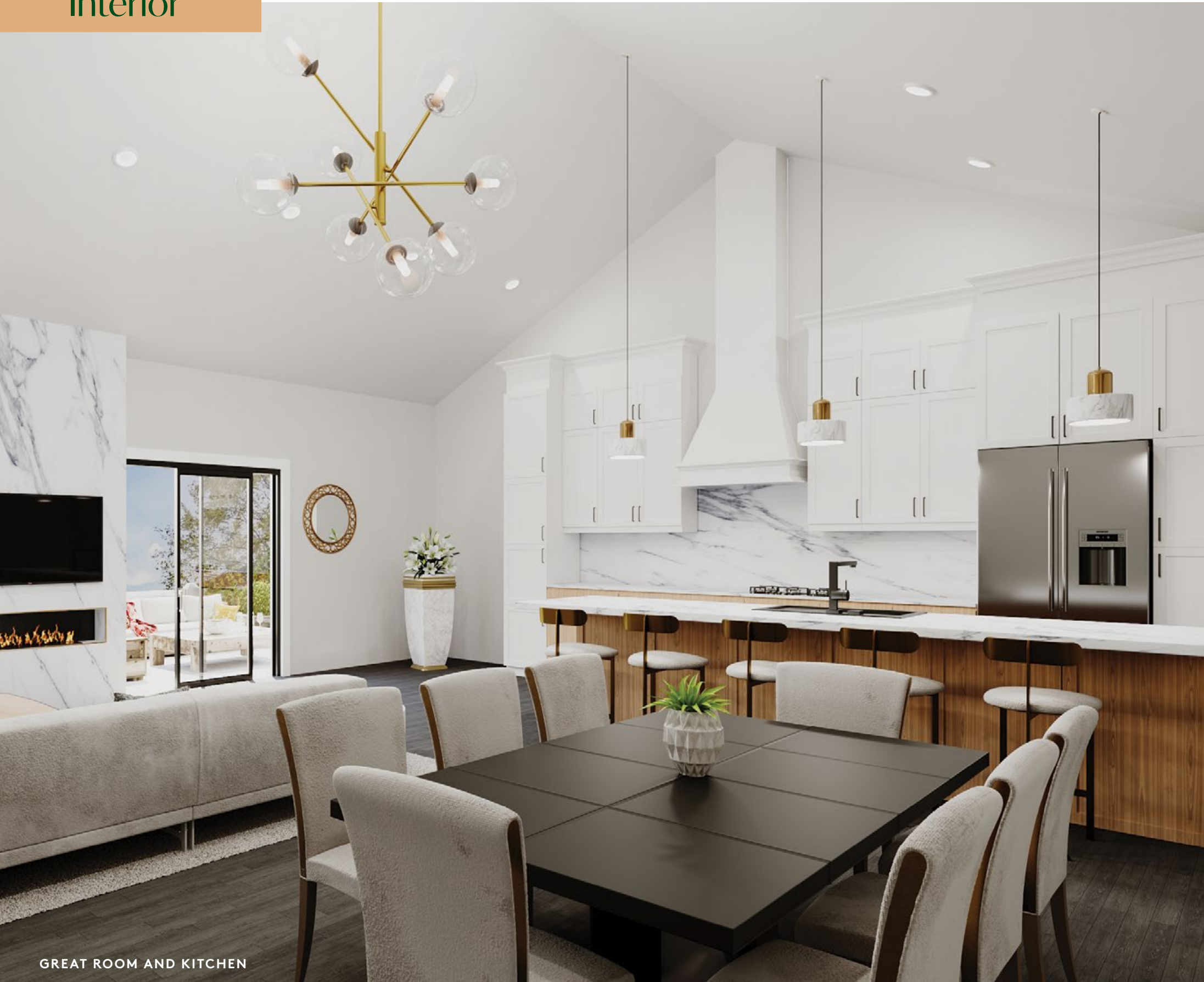
GREAT ROOM AND KITCHEN