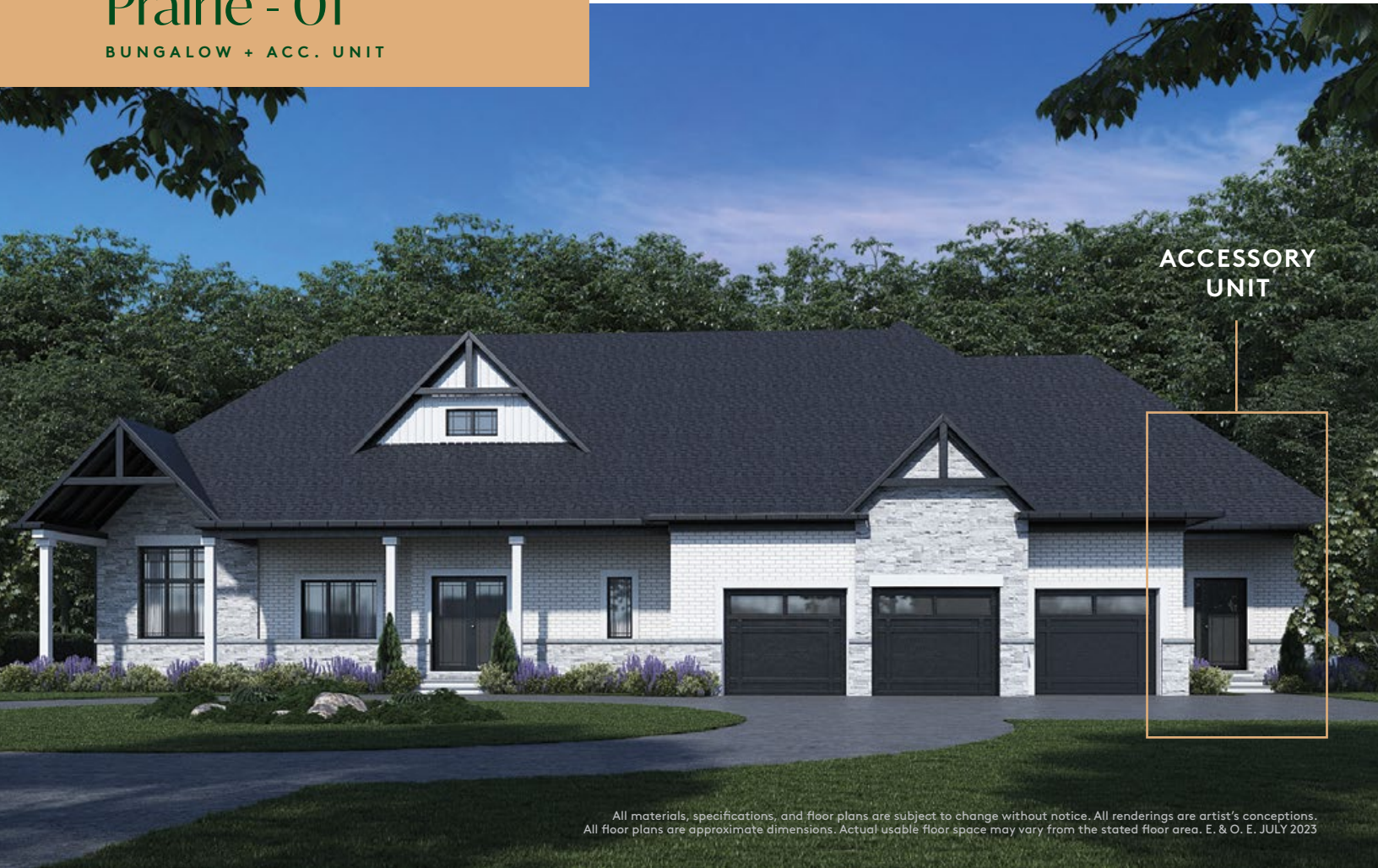
All materials, specifications, and floor plans are subject to change without notice. All renderings are artist's conceptions. All floor plans are approximate dimensions. Actual usable floor space may vary from the stated floor area. E. & O. E. JULY 2023